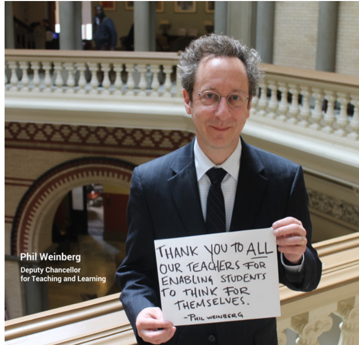
Phil Weinberg Deputy Chancellor for Teaching and Learning New York City Department of Education

#2 Official at America's Largest and Most Influential School System – $27,000,000,000 Total Budget, 1,800 Schools, 1,200,000 students